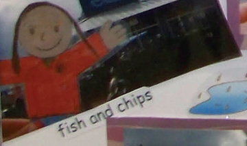
Fish and chips