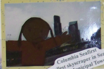
Columbia Seafirst (the tallest skyscraper in Seattle) and the Municipal Tower