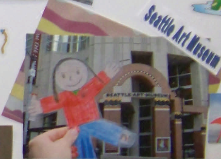
Seattle Art Museum