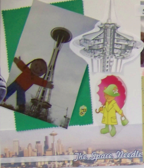
The Space Needle